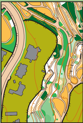
The cliff strip in Scarborough is home to a complex mass of zigzagging Victorian pathways. Note the areas of impassable vegetation.

in their finery to easily walk about and admire