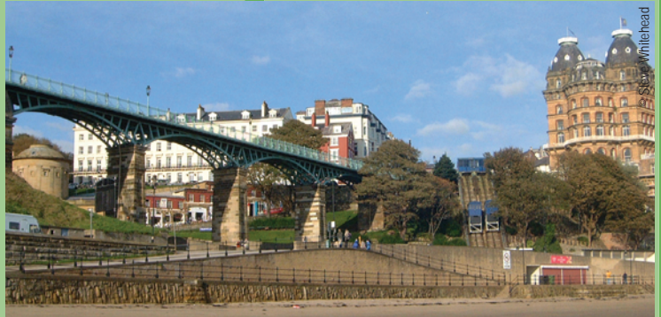
The valley footbridge from the Assembly area.