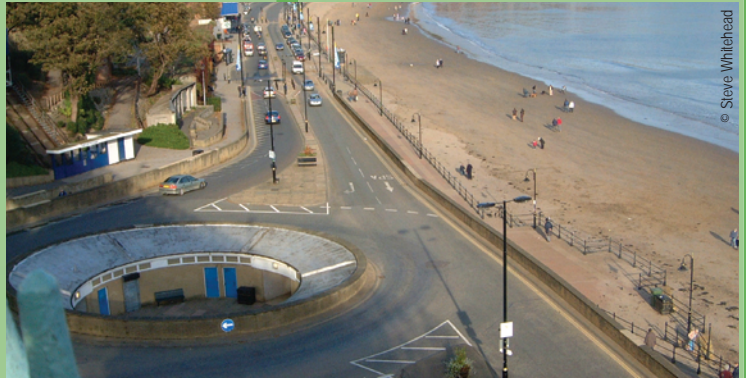
Looking down to the underpasses and assembly from the valley footbridge.