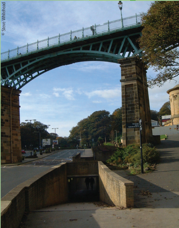
Looking SW under the valley footbridge.

Similarly the main valley road bridge has been removed to show the detail beneath. The courses may pass beneath the bridge but none will go over it.